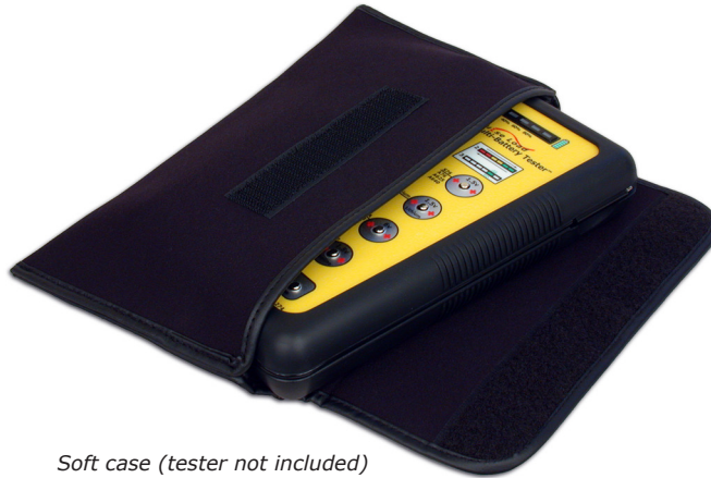
Soft case (tester not included)